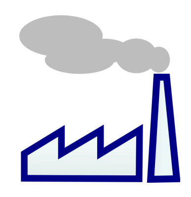
Doc #4: Ridgeway Coal Plant Environmental Impact Report

The Following is an estimation of negative environmental effects caused by the Ridgeway Coal Plant